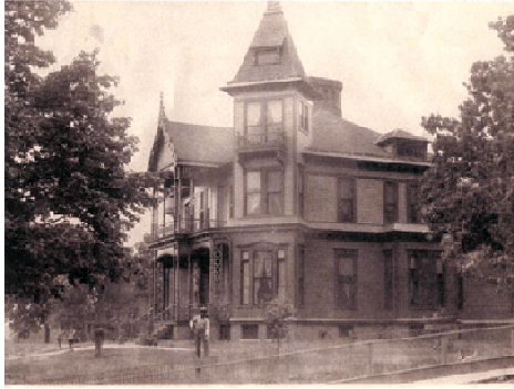
History of Branson House